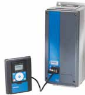
KEYPAD DOOR MOUNTING KIT