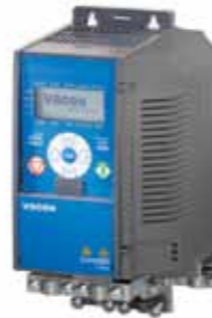
OPTION BOARD MOUNTING KIT